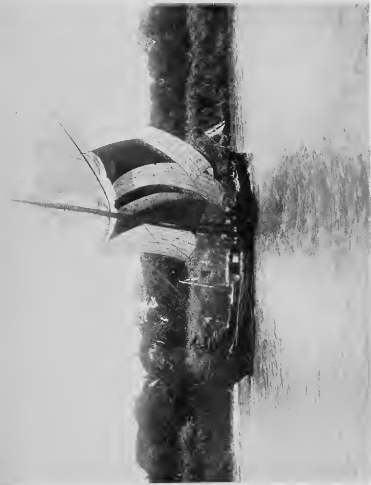
Burmese Cargo Boat